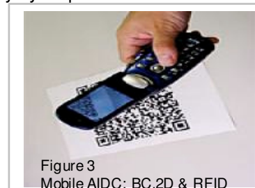
Figure 3 Mobile AIDC: BC.2D & RFID

“Mobile Item Identification and management in support of consumer applications”, this is the title of one of the new work items. So the decision was agreed following the request from Korea. Same time an Ad Hoc group was established for it. Potentially companies in the area of communication services might be extremely interested in it, because this work item might offer better business opportunities than the Internet of Things vision have done did yet.